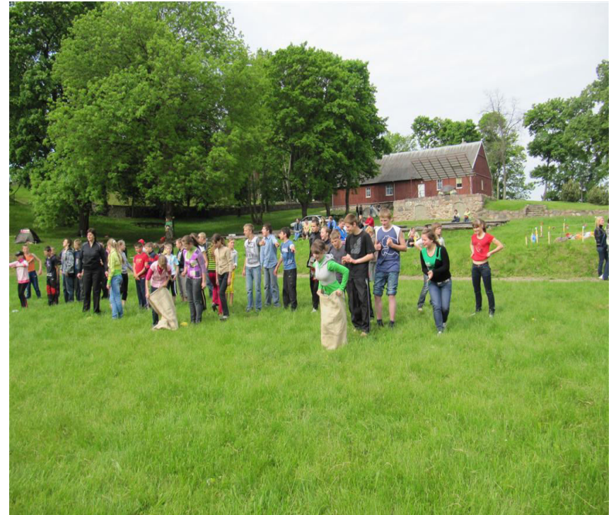
Traditional Tourism Day