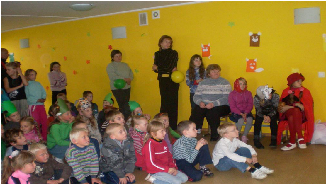
Contest for primary school pupils “Let’s Help Children to Start Loving Books”