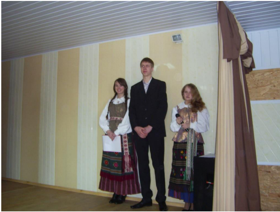
February 16th, the Day of Lithuania's Act of Independence Our pupils in the house of Local Community. Children are dressed in national costumes