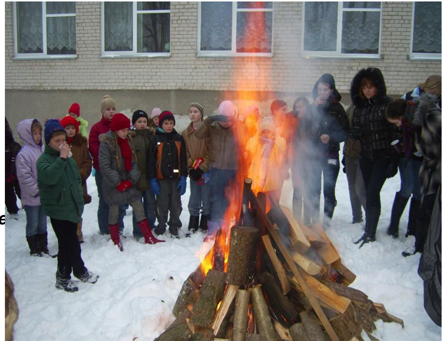
Remembering January 13th, the day when in 1991, as a result of Soviet military actions, at least 14 civilians were killed and more than 600 injured