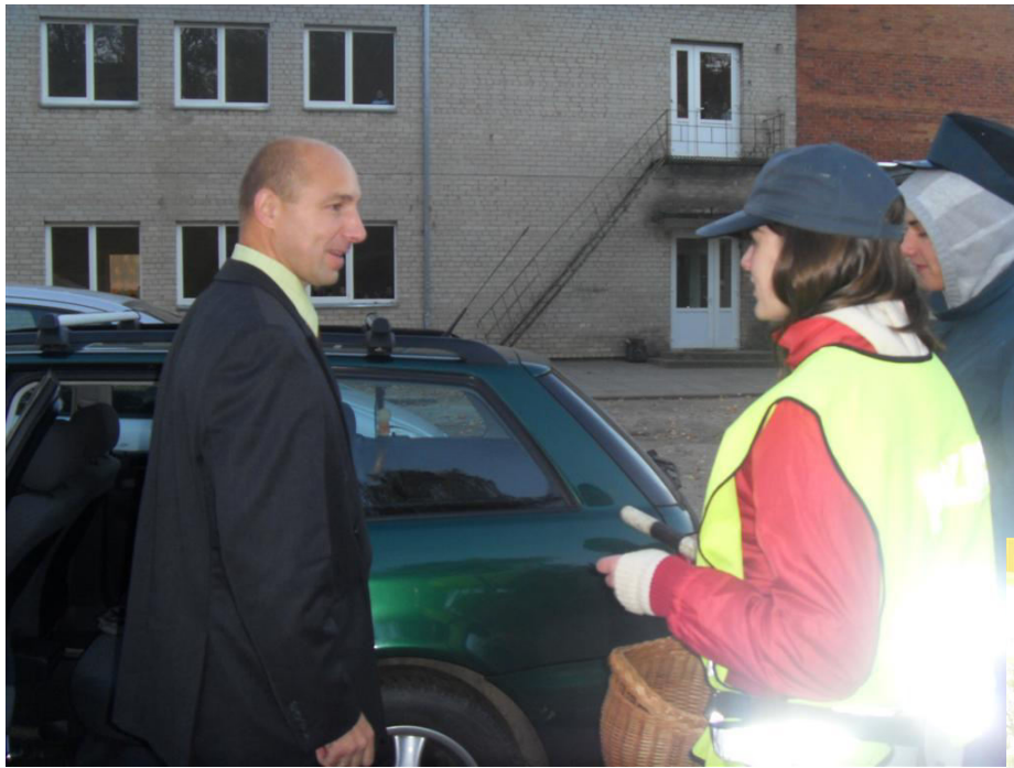
Traditional “Teachers’ Day”, October 5th