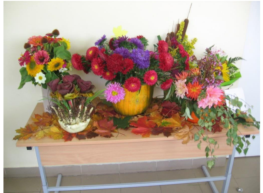
Traditional “Autumn’s festival’s” display, things made of vegetables, flowers and fruit