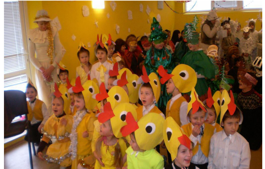
New Year Carnival