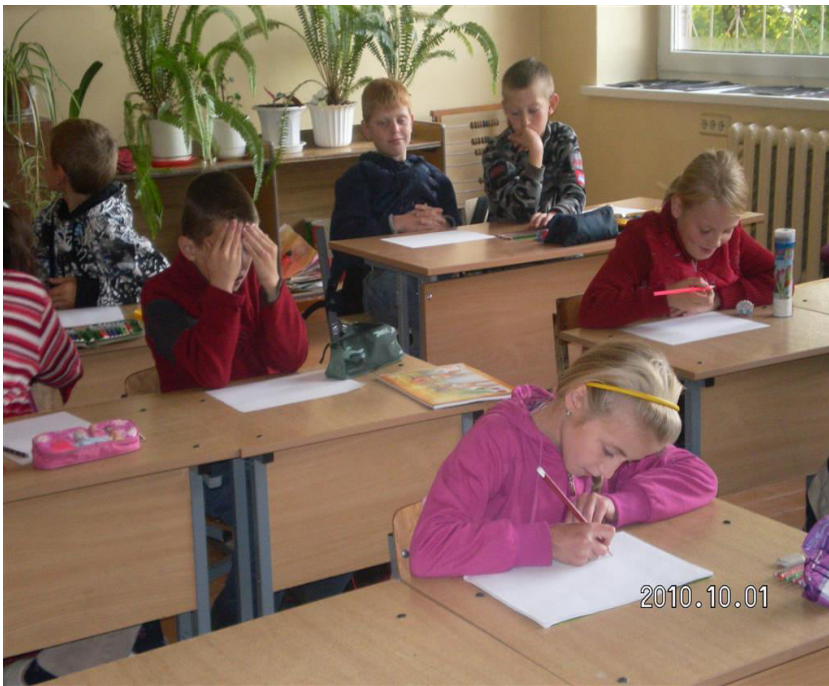
“The Exam of Constitution“, Constitution Day