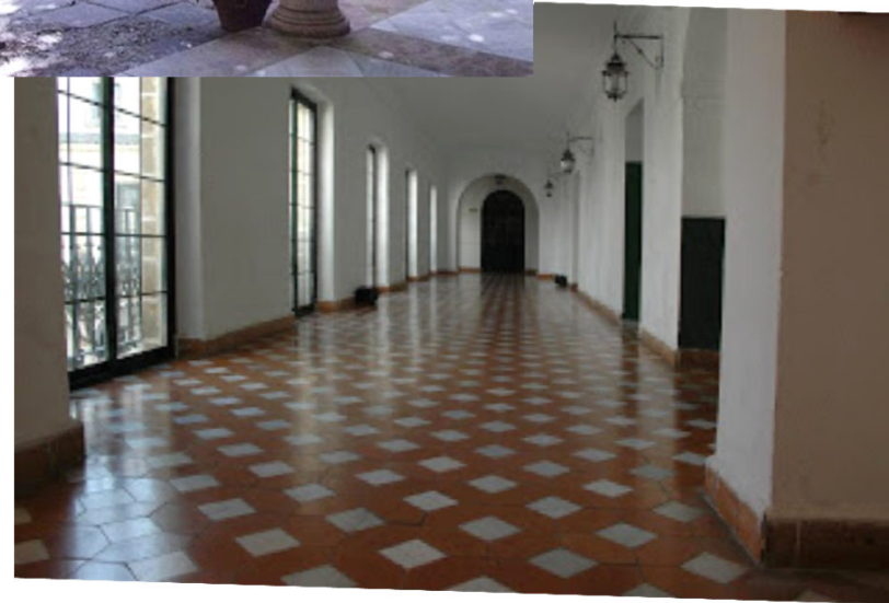
Corridor of Minerals and Fosils